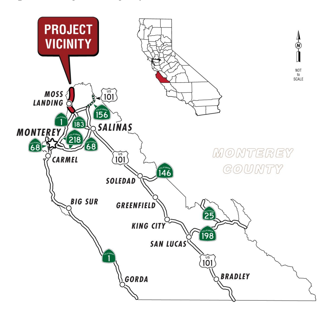
Figure 1-1 Project Vicinity Map