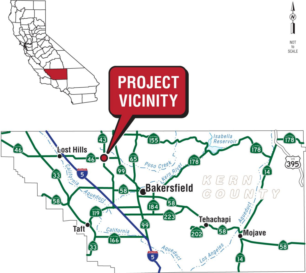
Figure 1-1 Project Vicinity Map

utilities and utility poles will be relocated by the California High Speed Rail Authority prior to roundabout construction starting. The project will include a 10-foot-wide shared-path sidewalk and a 5-foot buffer to accommodate pedestrians and bicycle passage away from the roundabout traveled way.