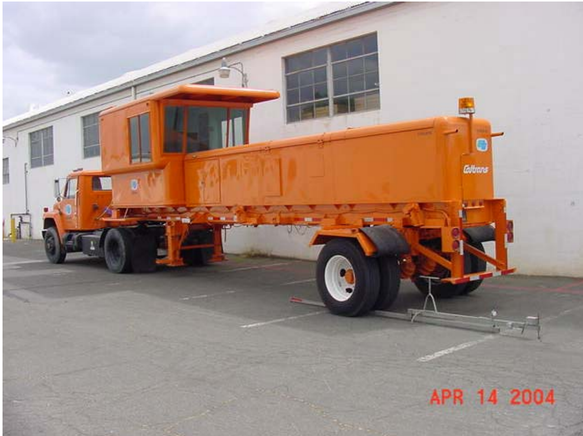
Figure 1. California deflectometer with Benkelman Beam placed between the dual tires of its rear axle.