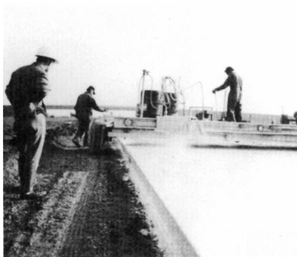
FIGURE 3 Spray Equipment Passing Over Test Pads