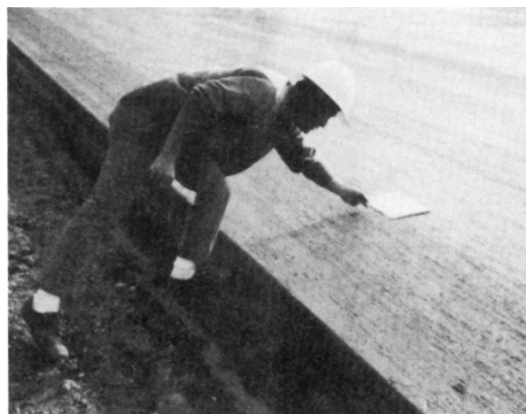
FIGURE 1 Placing Test Pads on Pavement

Approximate Rate of Application ft 2 /gal, based on actual measured test pad area 14 in. x 14 1 / 4 in. assuming a specific gravity for curing compound of 1.00. For specific gravity different from 1.00, multiply “application rate” from Table 1, times the actual specific gravity of the compound.