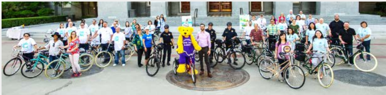
State BikeShare Program, May 2017

The extant bicycle lockers and bicycle cage at Caltrans Headquarters are being used to store and maintain the BikeShare bicycles. Caltrans employees are using the BikeShare bicycles to get to offsite meetings and exercise on their breaks. As of April 2017, more than 300 Caltrans employees have used the BikeShare Program as part of their workday. As a State of California initiative, the BikeShare program currently has 18 participating State agencies. This three-year effort is poised to expand throughout the State of California.