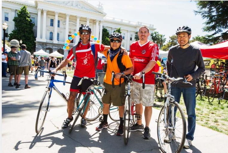
May is Bike Month BikeFest, 2017

Each year during MIBM, BikeFest is held on the west side of Capitol Park in Sacramento. Dozens of bicycle advocacy groups, government agencies, bicycle shops, and others are represented at the BikeFest. At this year's event, Caltrans provided information on its bicycle program, ATP, and other materials related to its non-motorized strategies. BikeFest participants support the common cause of promoting more bicycling as a healthy, low-carbon footprint alternative to driving a car.