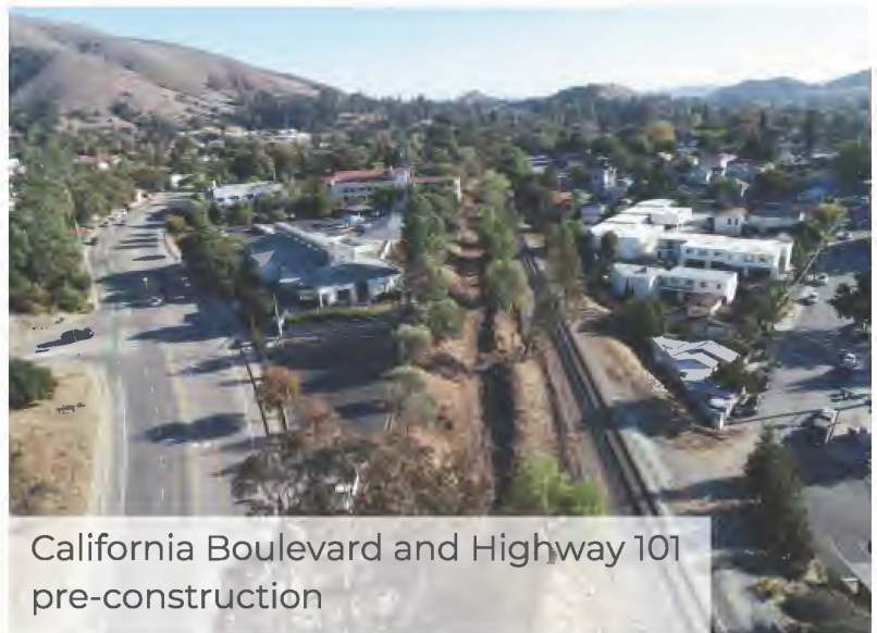
California Boulevard and Highway 101 pre-construction