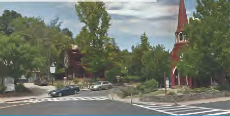
Pre-construction without curb bulbs out and accessible ramps