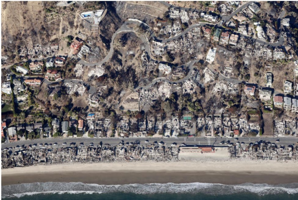
An aerial view of utility vehicles parked near beachfront homes destroyed in the Palisades Fire as wildfires cause damage and loss through the L.A. region on Jan. 13, 2025 in Malibu, California.

Officials said they have not ruled out whether embers from the New Year's Eve fire sparked back up amid high winds on Jan. 7.