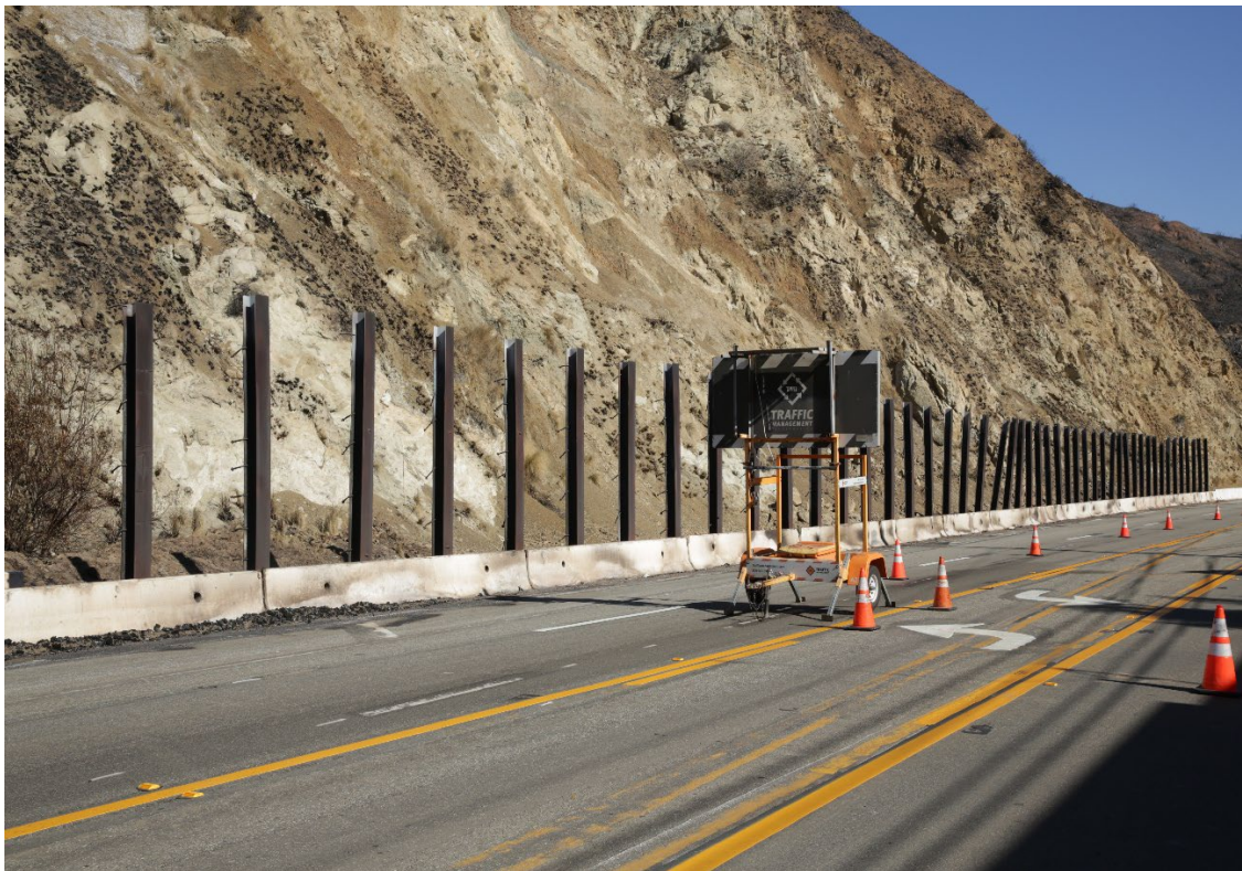
07-LA-Typical Wildfire Damage