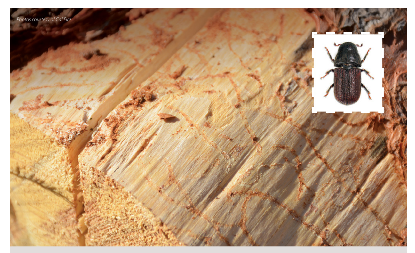
Bark beetles, inset photo, bore tunnels into trees, cutting off their food supply that eventually results in their death. The voracious beetles attack stressed trees that are unable to produce enough resin to fend them off. The dead and dying trees along roads pose a danger to passing travelers.

If the California beetle infestation parallels Colorado's recent experience in the Rocky Mountain forests, the state can expect a 10-12 year period of tree mortality before the infestation returns to normal levels. Total costs for Caltrans alone are expected to rise to as much as $500 million should the die-off continue for another decade.