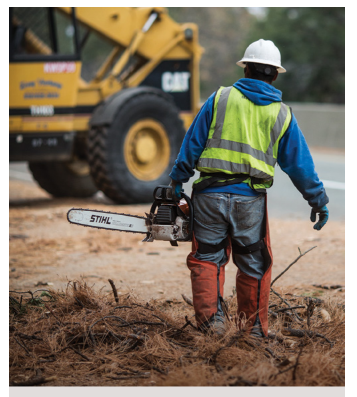
A forester carries the main tool of his trade as he helps clear dead trees along U.S. Highway 50 in El Dorado County. Many of the cleared trees are sent to biomass plants to generate electricity.