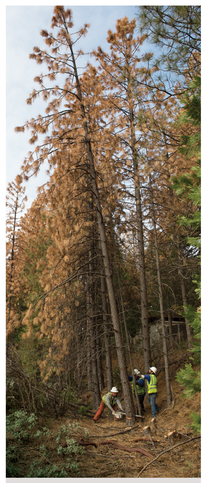
Only certified arborists and licensed foresters can be hired to identify and target trees, so contractors doing the work only remove those specimens. Above, contractors remove trees in December 2016 along U.S. Highway 50 in El Dorado County, near Pollock Pines.