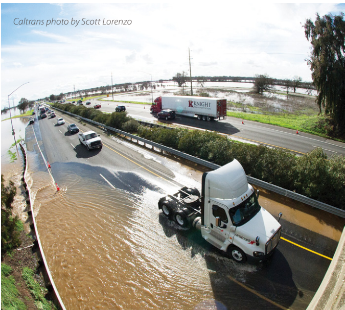
Caltrans photo by Scott Lorenzo

Caltrans' districts along the coast typically sustain the costliest road damage during heavy winters, con-