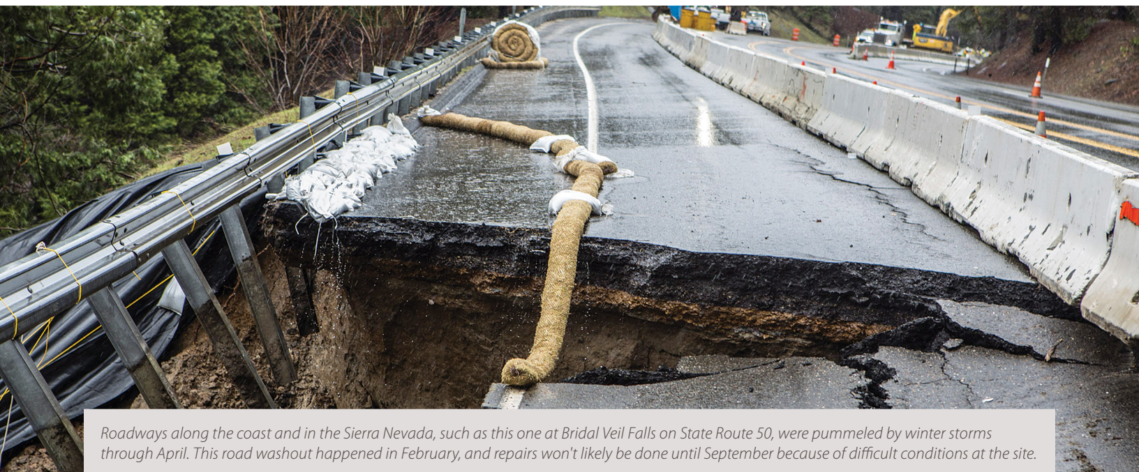
Roadways along the coast and in the Sierra Nevada, such as this one at Bridal Veil Falls on State Route 50, were pummeled by winter storms through April. This road washout happened in February, and repairs won't likely be done until September because of difficult conditions at the site.

Caltrans/Local Damage Estimate: $1.4 Billion and Still Climbing From 2017's Deluge