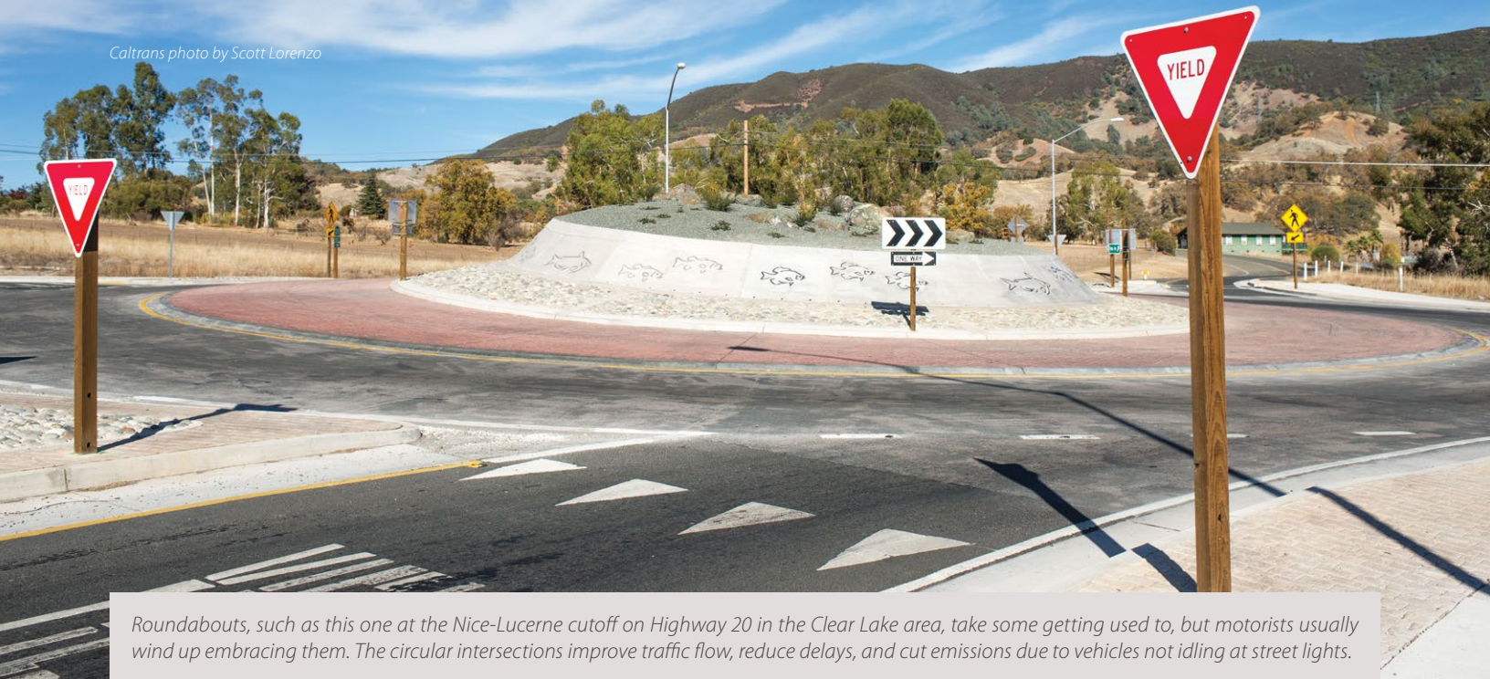
Roundabouts, such as this one at the Nice-Lucerne cutoff on Highway 20 in the Clear Lake area, take some getting used to, but motorists usually wind up embracing them. The circular intersections improve traffic flow, reduce delays, and cut emissions due to vehicles not idling at street lights.