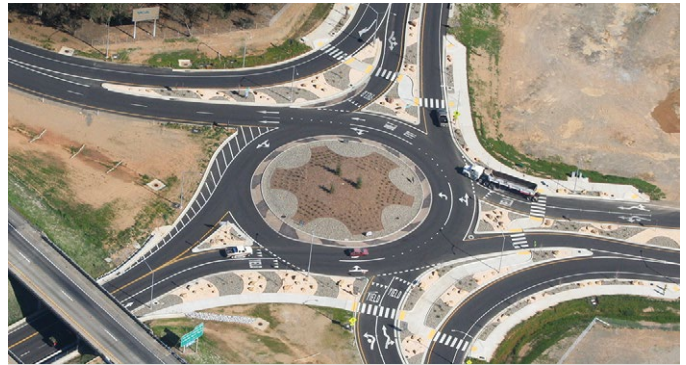
Studies show that roundabouts, this one at Interstate 5 and Deschutes Road in Anderson, lead to fewer accidents and deaths.

Roundabouts improve traffic flow and significantly reduce traffic delays and decrease pollution and greenhouse gas emissions by allowing vehicles to move through intersections without stopping.