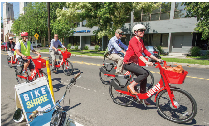
Bike sharing has expanded quickly, with about 28 million users nationally as of 2016. Almost 14,000 shared bikes are in use in California.

More than 8,100 shared bicycles are in use in Northern California; about 4,700 in Southern California.