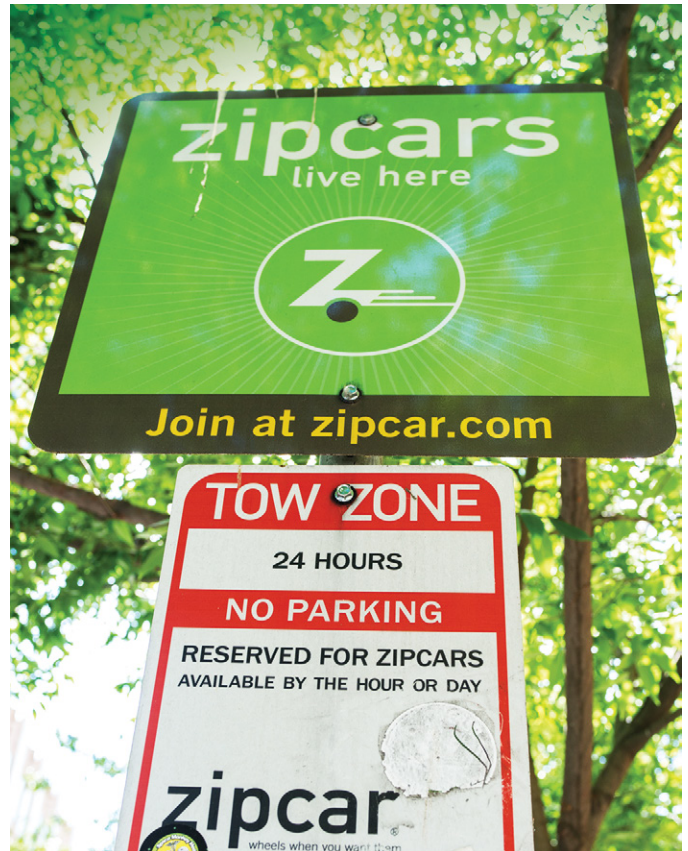
Many cities have embraced the shared car concept, establishing zones where short-term rentals can be picked up and dropped off.

Not only are modes of transportation changing, but major advancements have been made in vehicle safety technology. The refinement of on-board cameras, radar and sensors have led to the development of accident avoidance systems that warn of possible collisions, lane departures or oncoming pedestrians, as well as advanced braking assistance and adaptive cruise control.