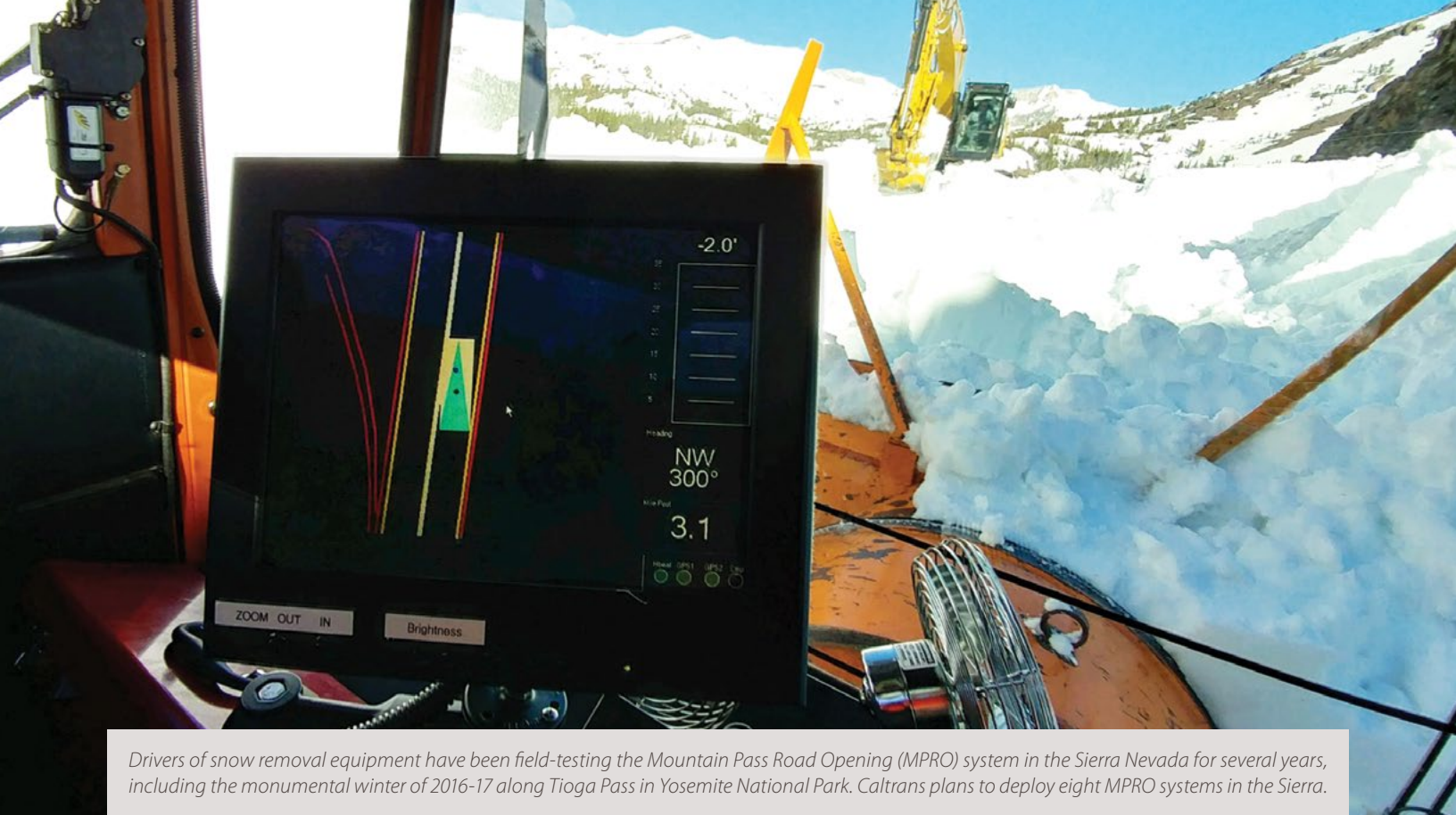
Drivers of snow removal equipment have been field-testing the Mountain Pass Road Opening (MPRO) system in the Sierra Nevada for several years, including the monumental winter of 2016-17 along Tioga Pass in Yosemite National Park. Caltrans plans to deploy eight MPRO systems in the Sierra.