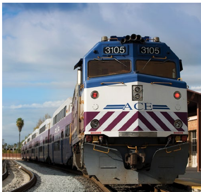
The Altamont Corridor Express carries riders between the Central Valley and Bay Area. SB 1 funds will help study regional rail connectivity.

Caltrans earlier awarded $41 million in local transportation planning grants for 64 projects that support more sustainable communities, reduce transportation-related greenhouse gases, and adapt for the effects of climate change.