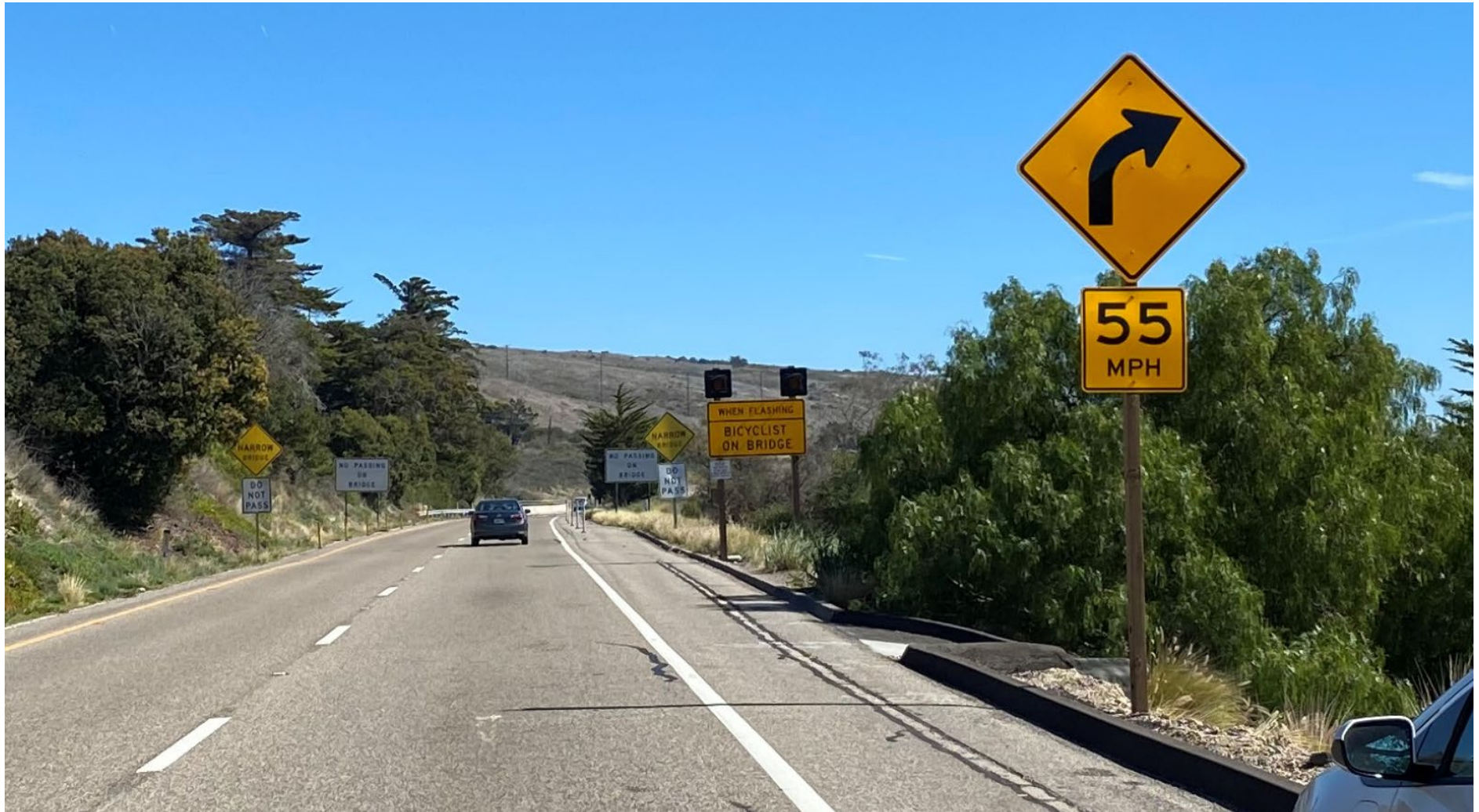
Looking southbound approaching Arroyo Quemada bridge