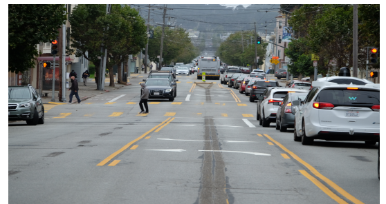
Figure 2: Post Project Conditions