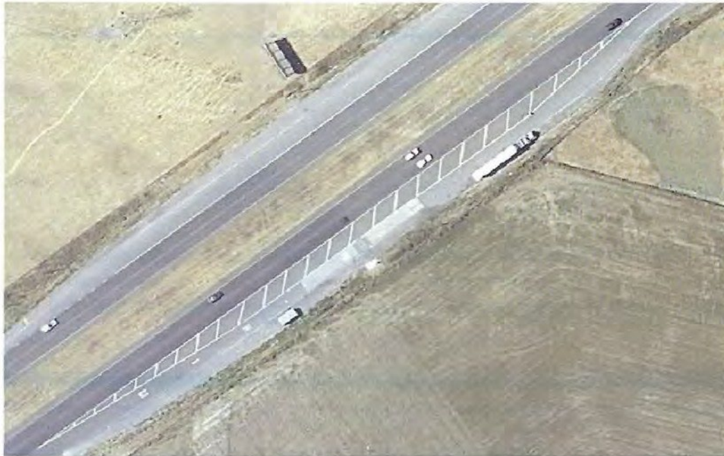
Mini-Site Location on Route 37 in Sonoma County

Mini-sites are designed as safe locations for portable scale operations and are strategically located on highways with an above-average volume of commercial vehicle traffic to screen vehicles that may use alternative routes to avoid CVEFs.