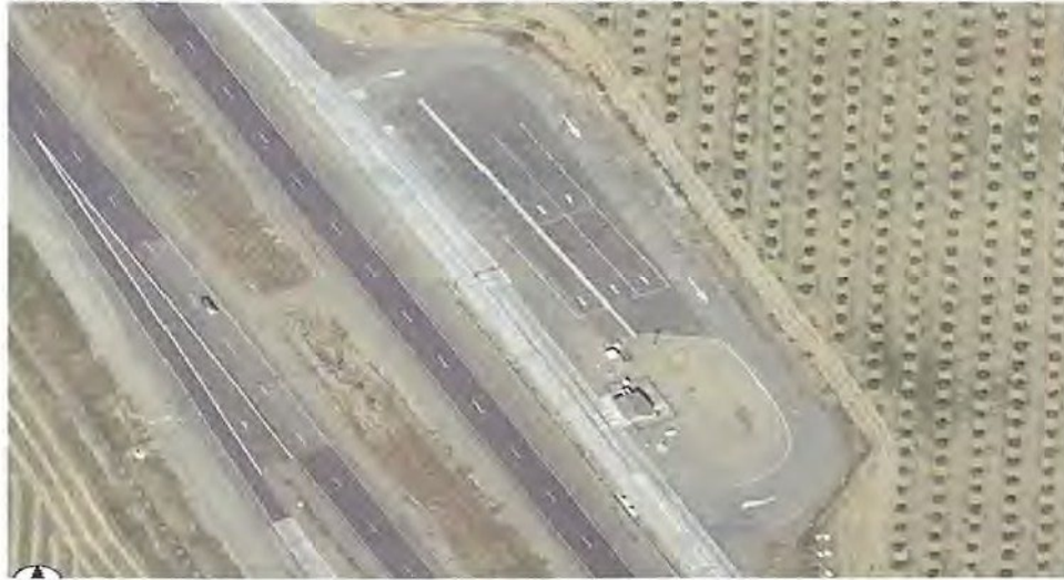
Class C CVEF at Santa Nella

Class C CVEFs are located at strategic points on major highway routes.