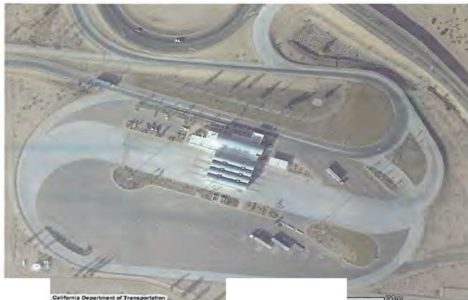
Class A CVEF at Calexico

Class A CVEFs are located at strategic POE into the state and have an independent CHP command identity.