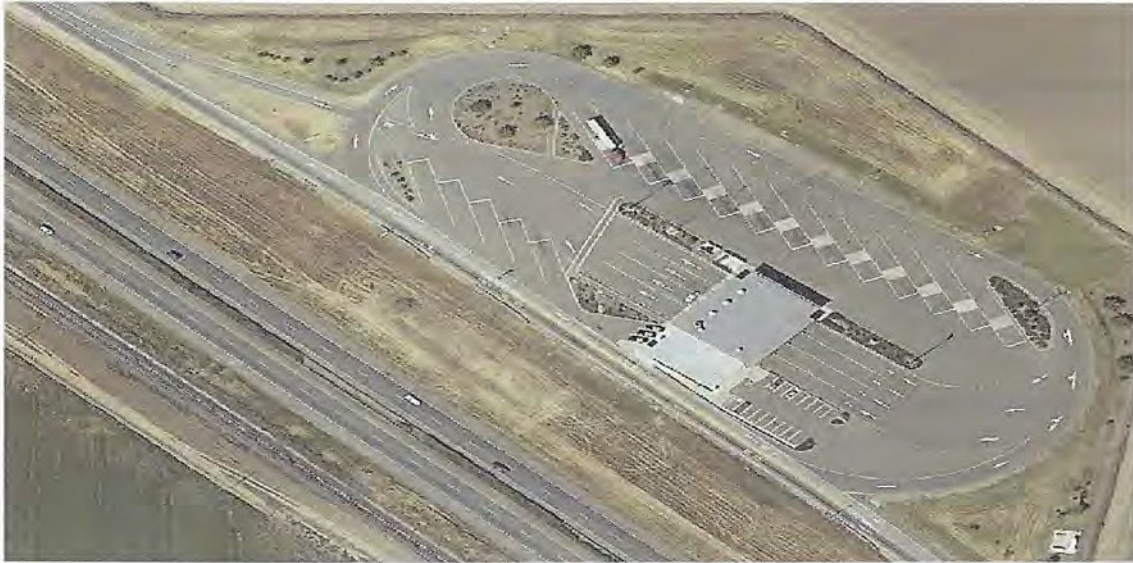
Class B CVEF at Chowchilla

Class B CVEFs are located along major highway routes and have an independent CHP command identity.